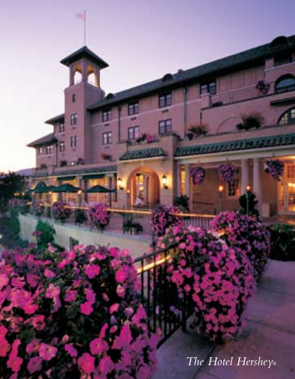
The Hotel Hershey.