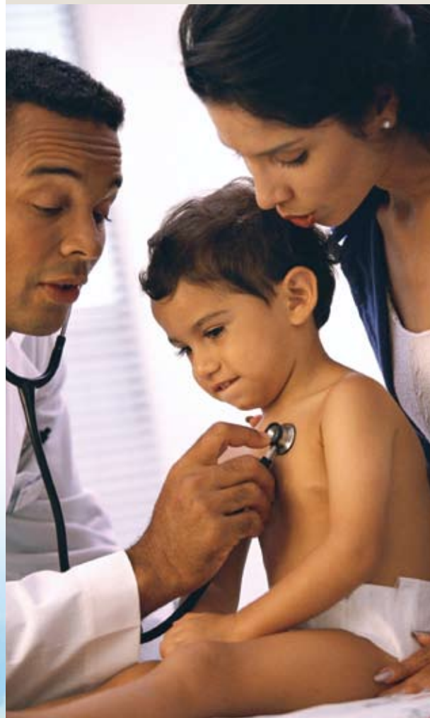
Penn State Milton S. Hershey Medical Center

Visit us at med.psu.edu/web/college/home .